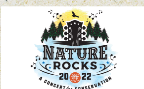
Events, page 2