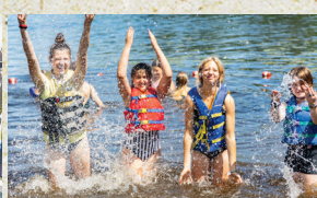
Upcoming Camps & More, page 4