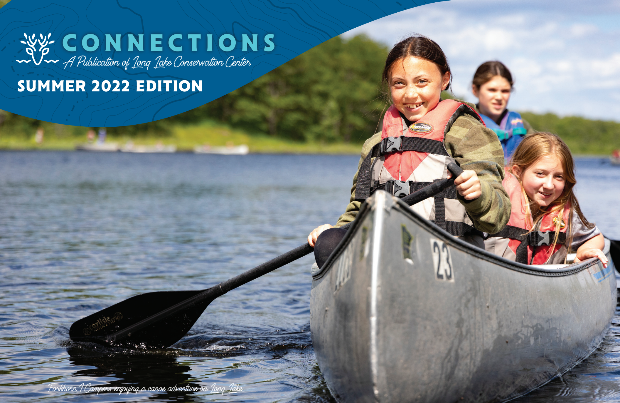
Forkhorn Campers enjoying a canoe adventure on Long Lake.