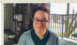
Nature School, page 3