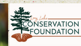
News and Notes, page 7