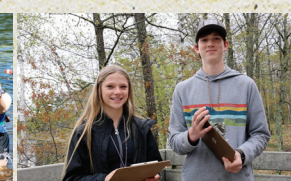
Student Phenology, page 5