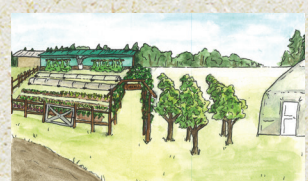
A Glimpse into the Future, page 1