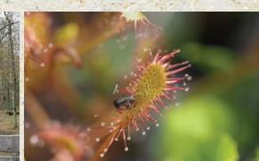
Nature Photos, page 6